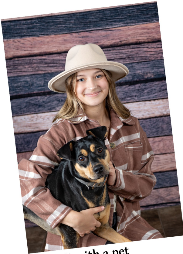
Portrait with a pet