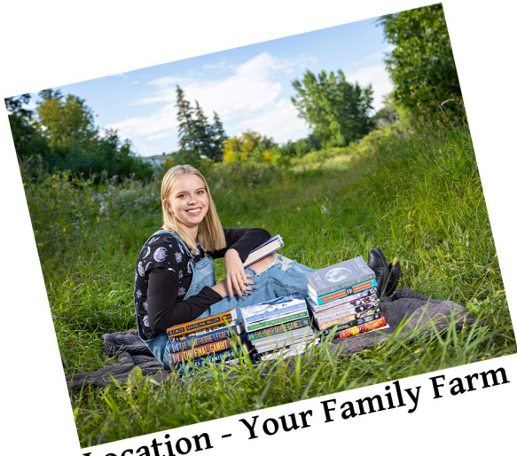
Location - Your Family Farm