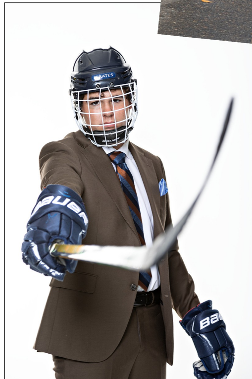
Props or Sports Equipment